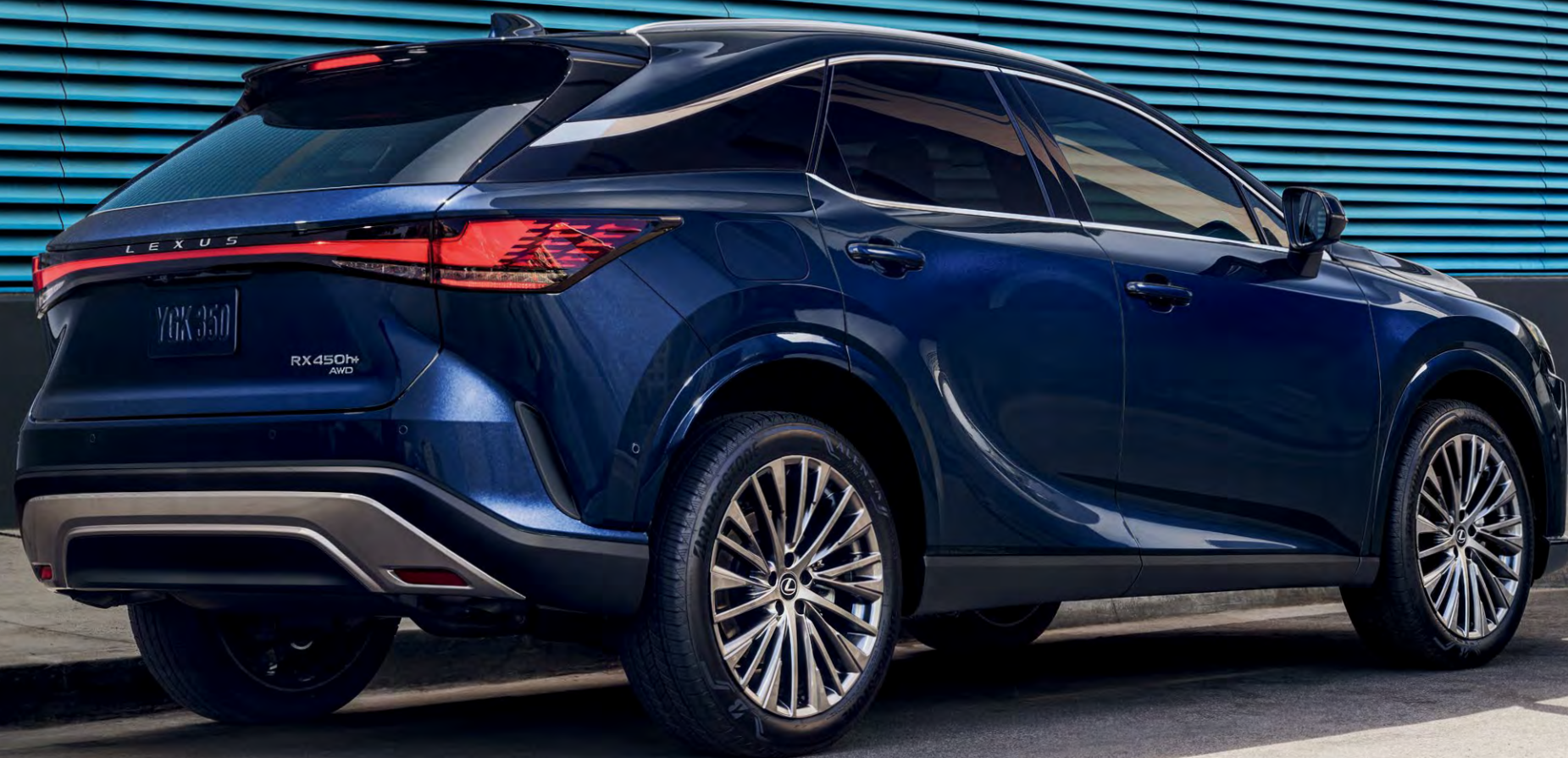
RX450h+ Luxury AWD shown in Nightfall Mica