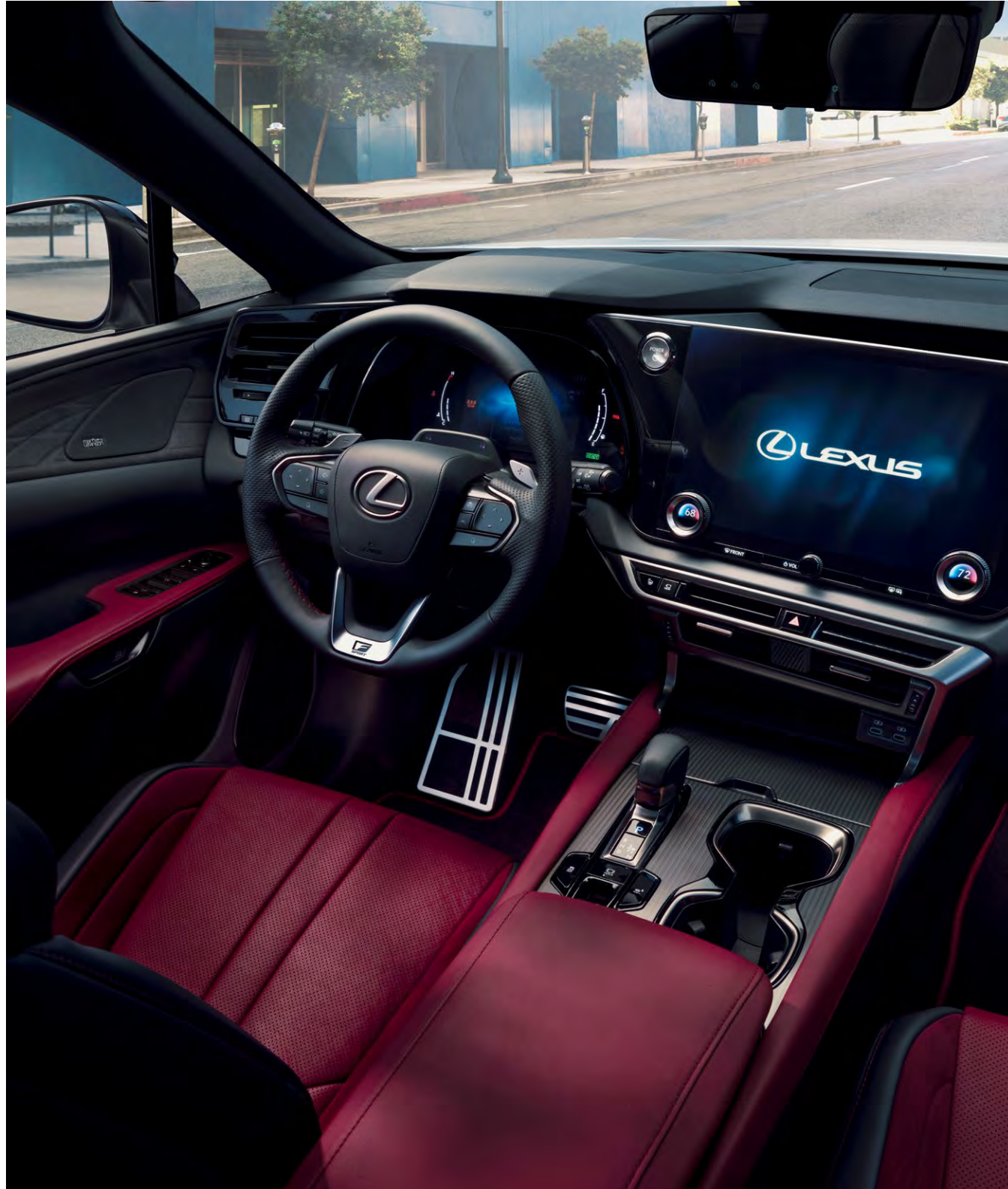
RX F SPORT Performance shown with Rioja Red leather and Dark Graphite Aluminum interior trim