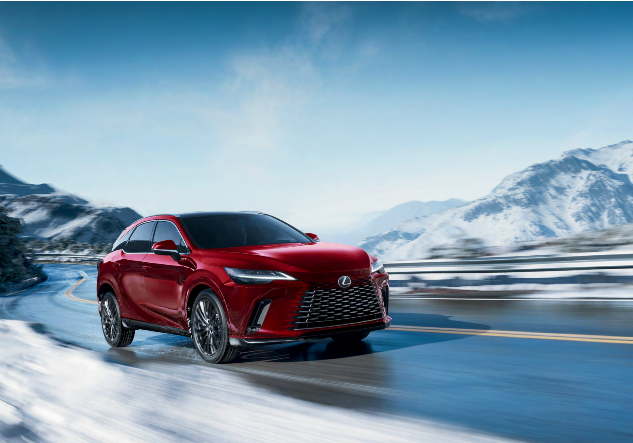
RX Luxury AWD shown in Matador Red Mica