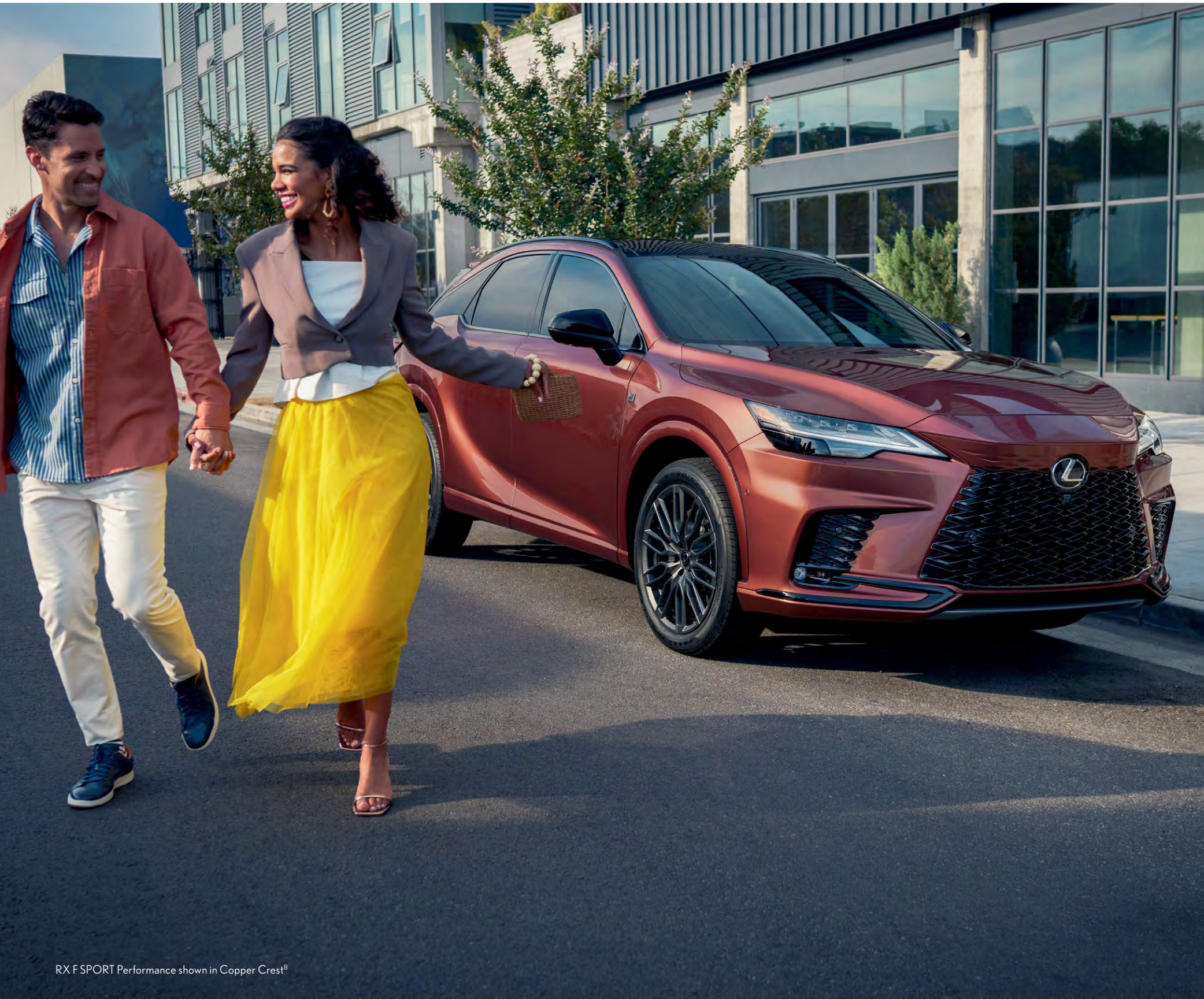
RX F SPORT Performance shown in Copper Crest®