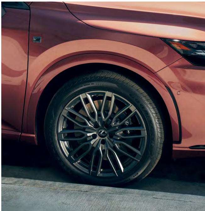
RX F SPORT Performance shown in Copper Crest®

For those who refuse to settle, this is the next generation of Lexus.