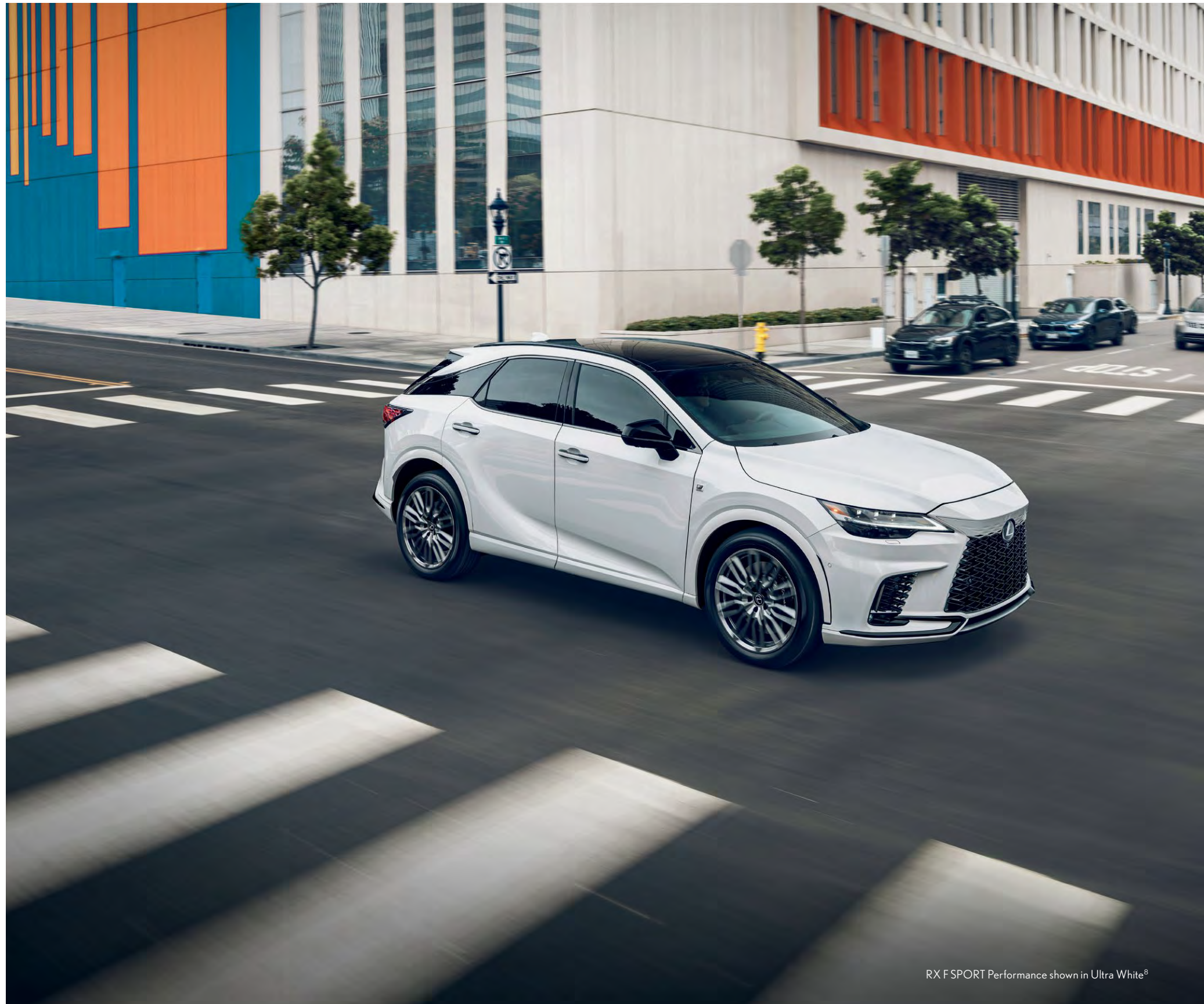
RX F SPORT Performance shown in Ultra White ®