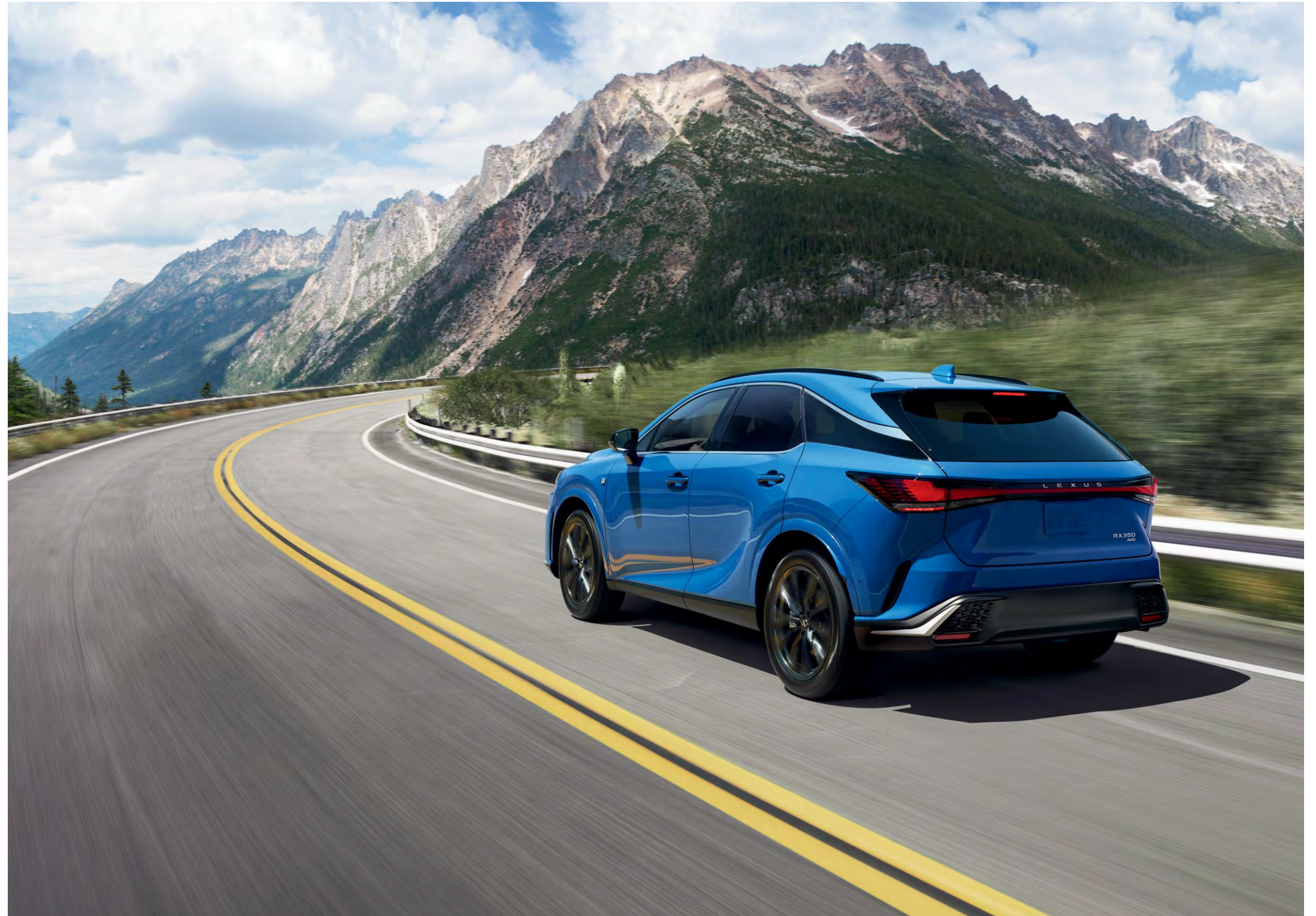
RX F SPORT Handling AWD shown in Grecian Water

To help provide the highest level of responsiveness, all F SPORT models offer selectable drive modes to help you finely tune your drive to suit your desires. Sport mode adjusts the Adaptive Variable Suspension, while Custom mode allows you to personalize everything from road feel to responsiveness. Further enhancing the excitement, an exclusive performance-inspired gauge cluster provides real-time information such as G-force metrics, power distribution and more.