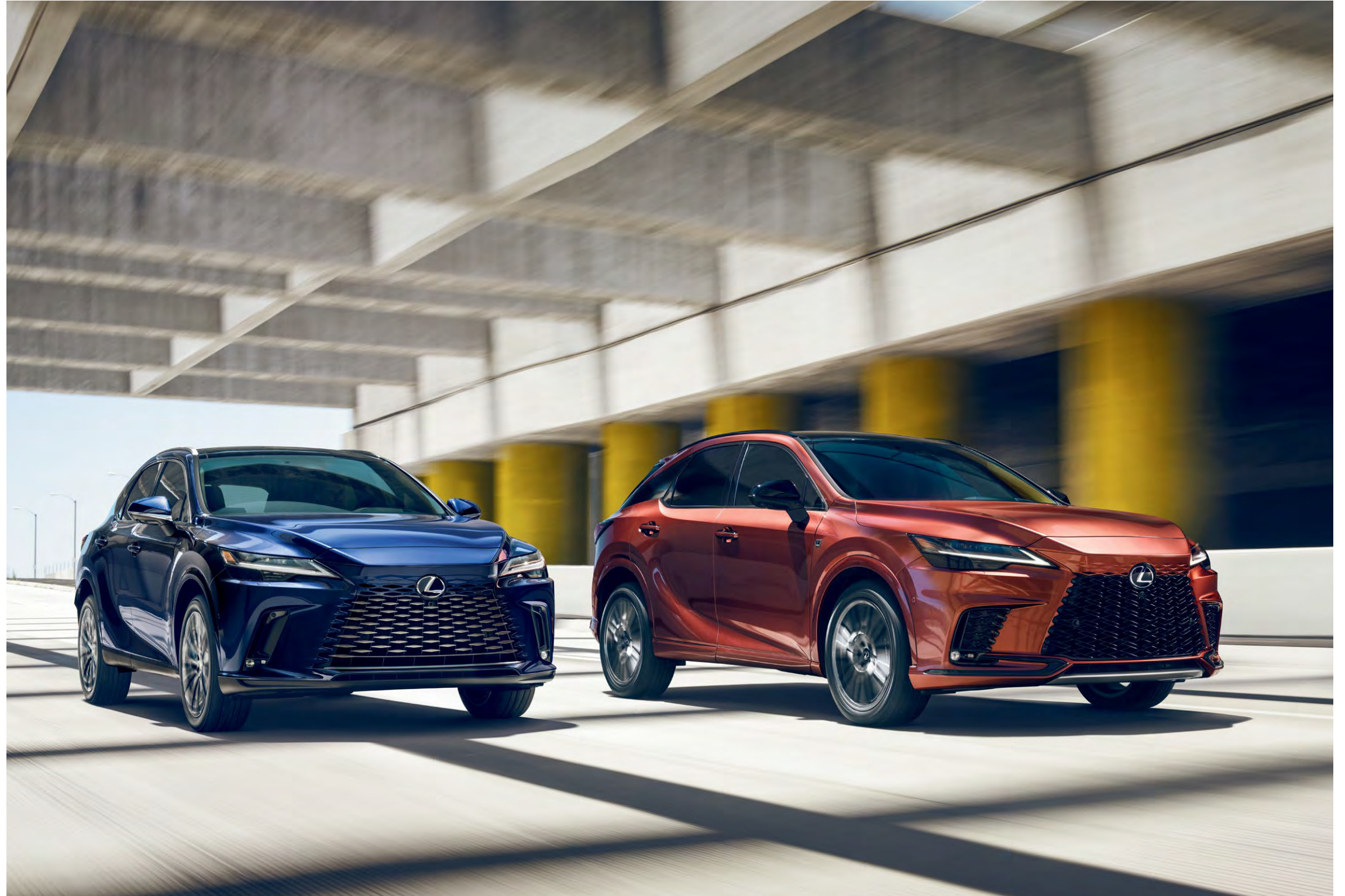
RX Hybrid Luxury shown in Nightfall Mica (left), RX F SPORT Performance shown in Copper Crest 8 (right)

For the greatest thrill offered in an RX, the F SPORT Performance boasts an exclusive electrified powertrain. Featuring a 2.4-liter turbocharged gasoline engine, a high-output battery and two electric motors, it produces 366 net combined horsepower 3 and 406 lb-ft of torque. 4 It delivers a drive unlike anything you've experienced and helps make the RX F SPORT Performance our fastest, most powerful RX.