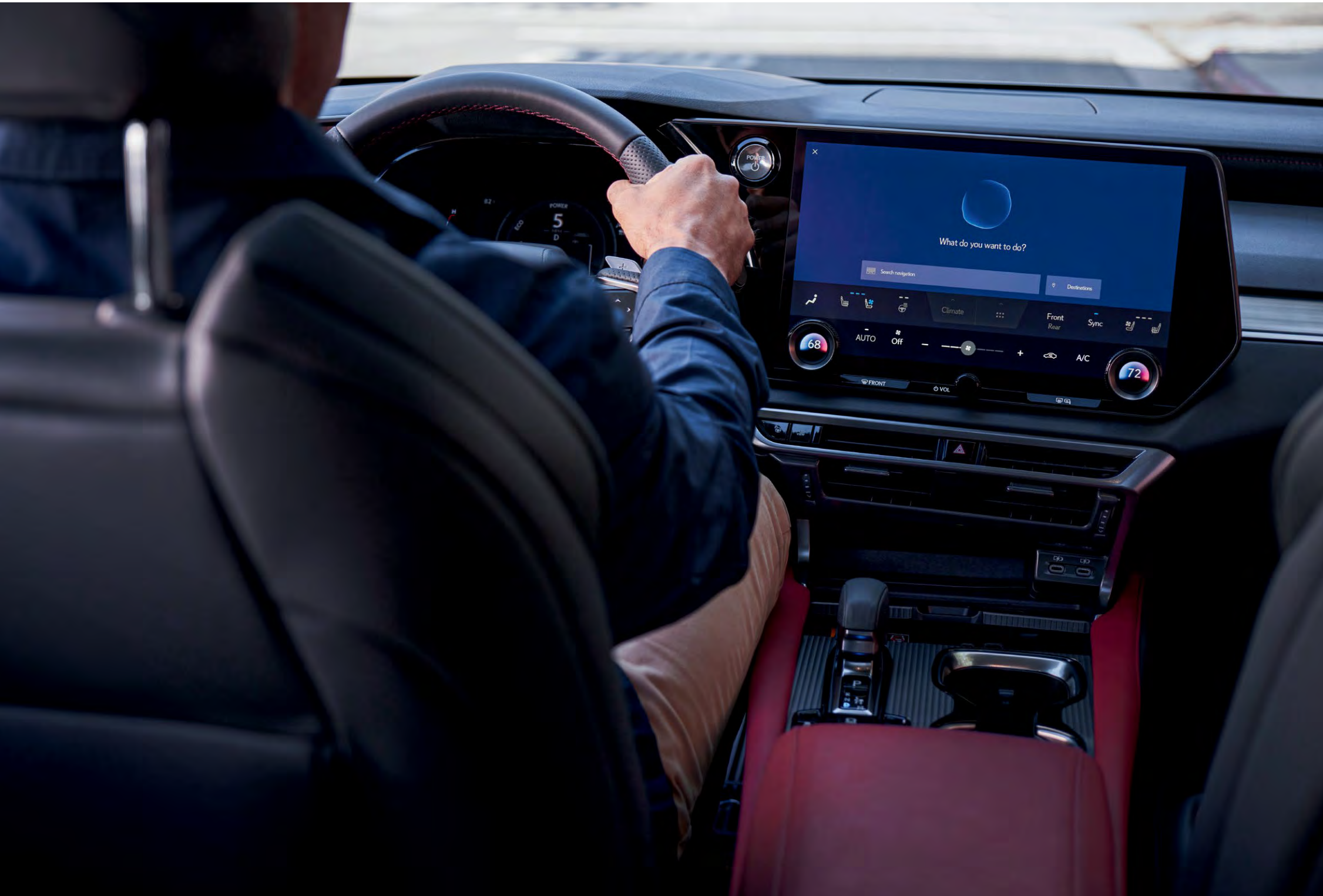
RX F SPORT Performance shown with 14-inch touchscreen display and Rioja Red leather and Dark Graphite Aluminum interior trim