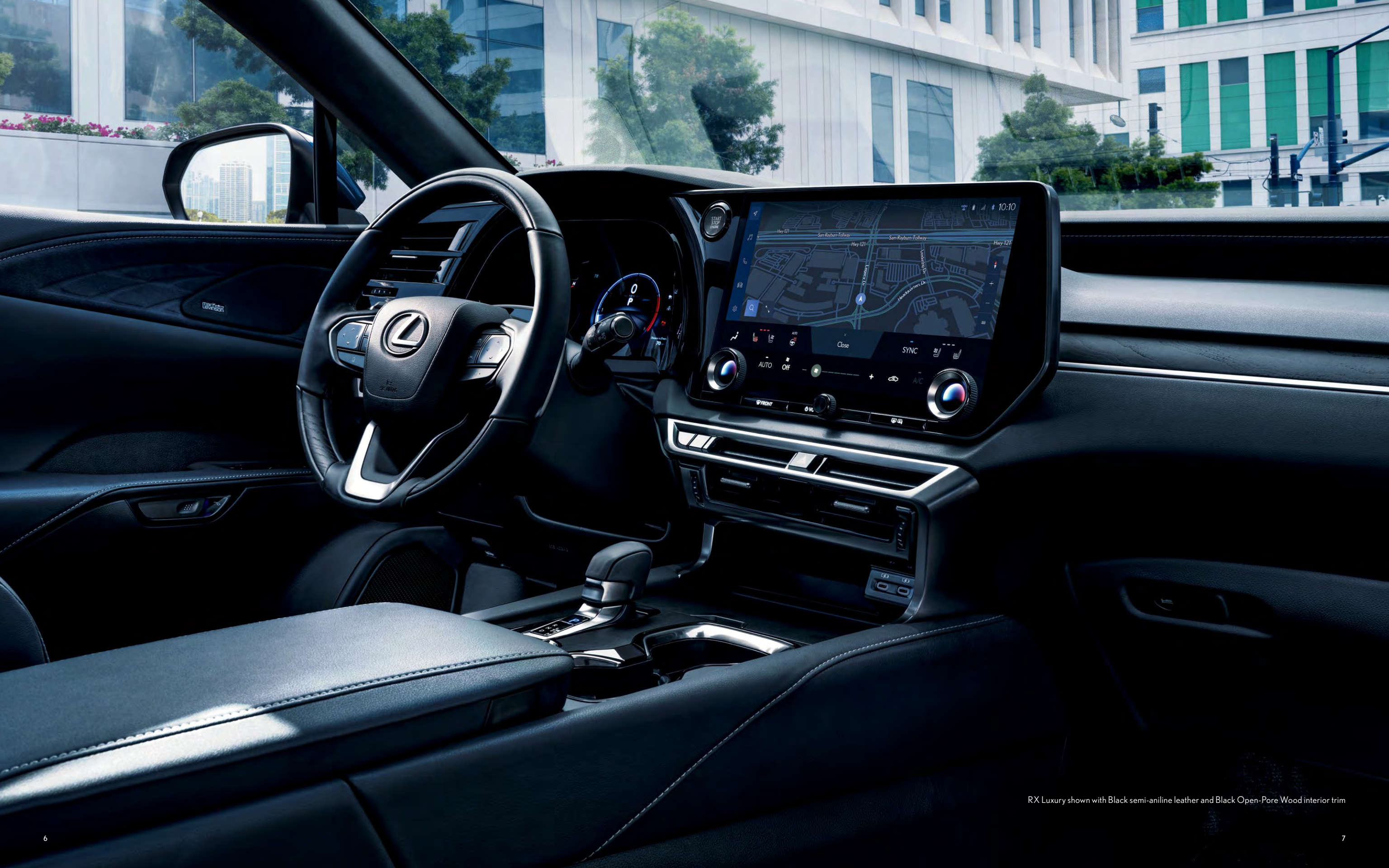
RX Luxury shown with Black semi-aniline leather and Black Open-Pore Wood interior trim