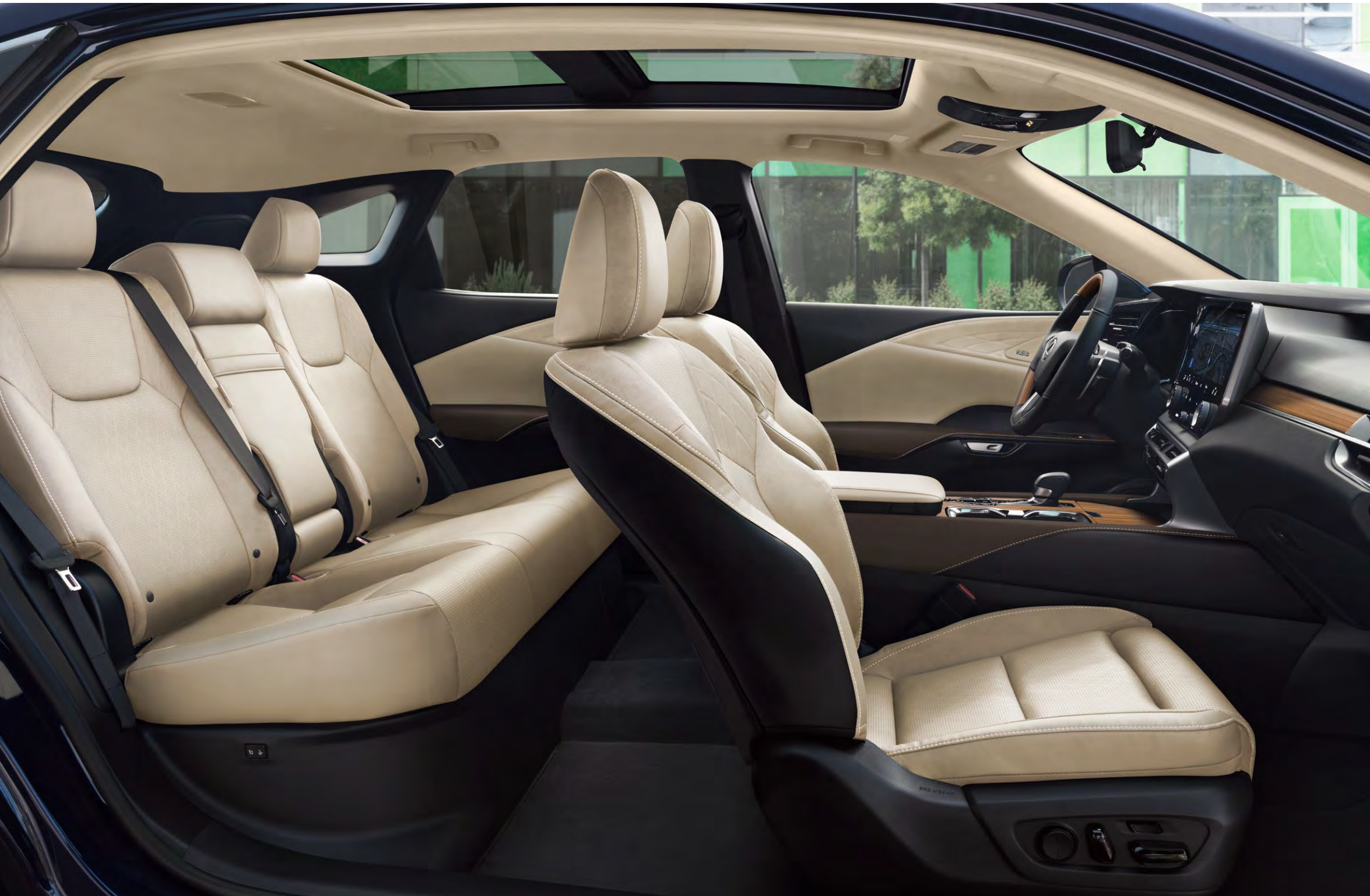
RX Luxury shown with Macadamia semi-aniline leather and Ash Bamboo interior trim