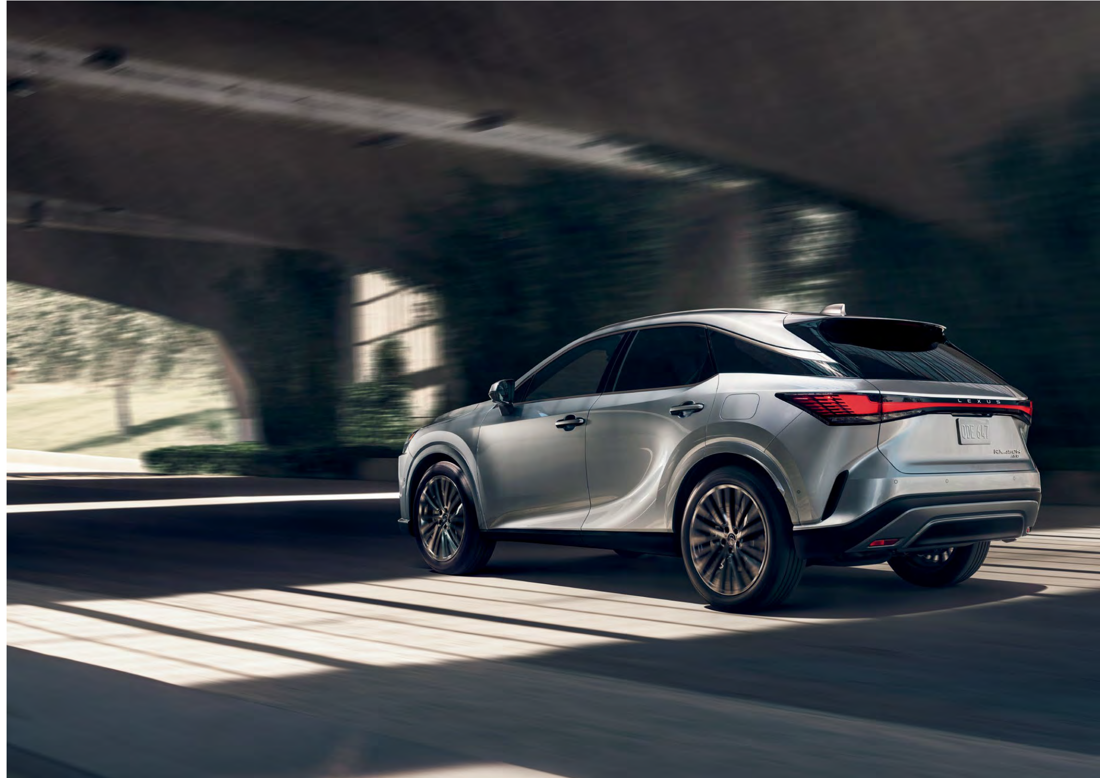
RX 450h+ Luxury AWD shown in Iridium 8

It starts with a generously equipped RX Luxury grade and adds a proven 2.5-liter in-line four-cylinder gasoline engine, a high-density lithium-ion battery pack and an advanced all-wheel drive system. With a full charge, the RX 450h+ has a manufacturer-estimated 37 miles of all-electric driving range 6 and a manufacturer-estimated 83 MPGe. 7 And when your journey takes you beyond the plug, the RX 450h+ can seamlessly continue to operate in hybrid mode and has a manufacturer-estimated 35-MPG combined. 7 So plug in on your schedule and see where your roads take you.