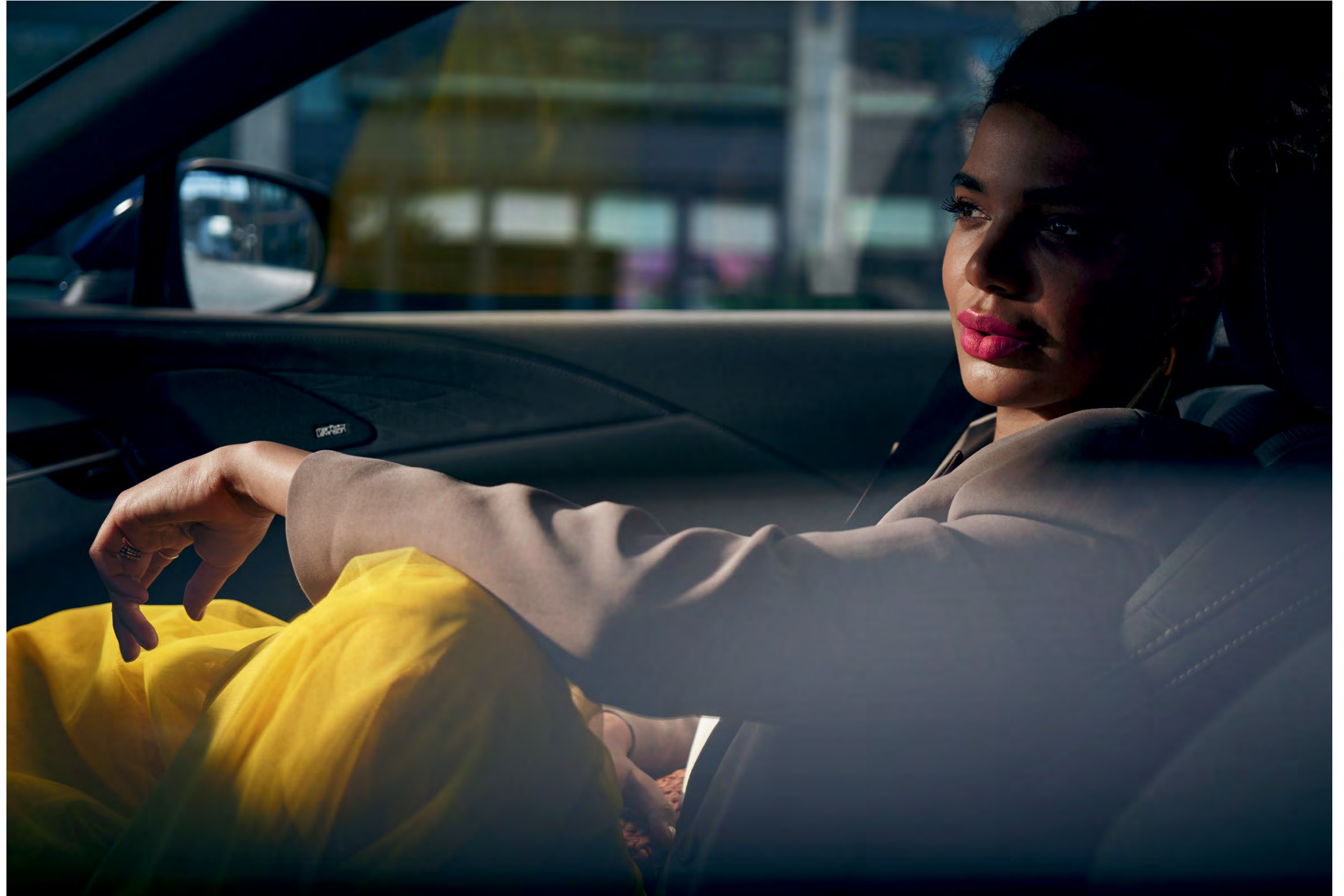
RX Luxury shown with Black semi-aniline leather and Black Open-Pore Wood interior trim