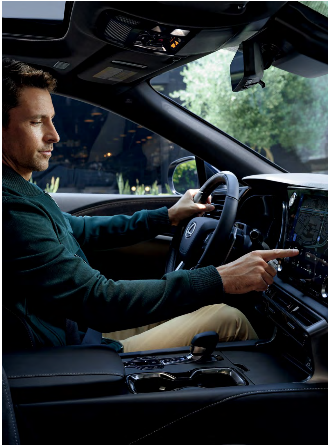
RX Luxury shown with Black semi-aniline leather and Black Open-Pore Wood interior trim