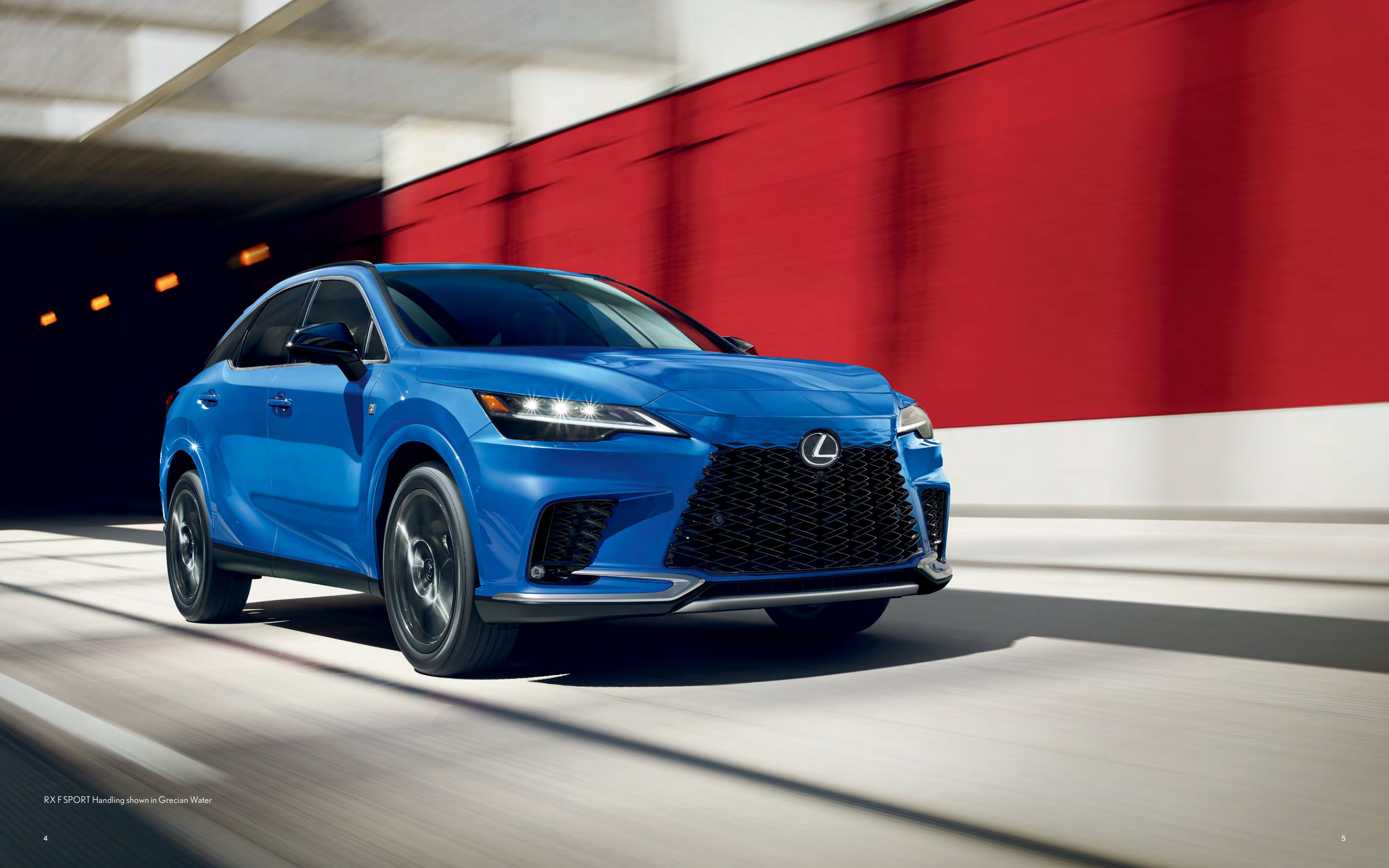
RX F SPORT Handling shown in Grecian Water