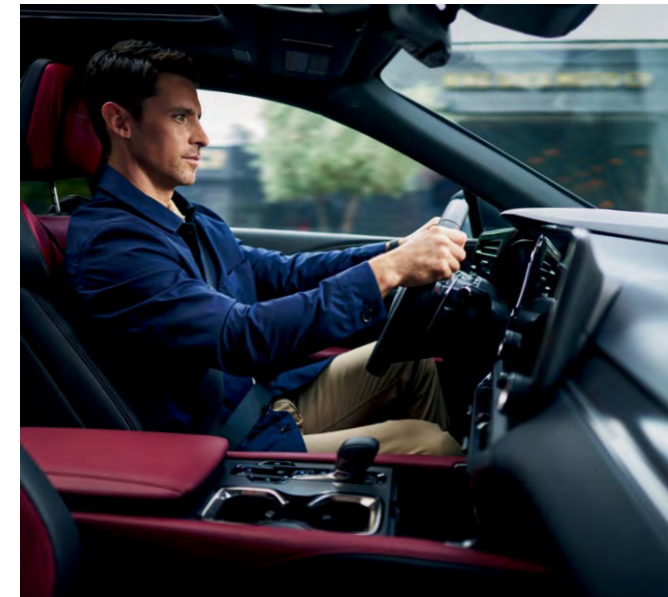
RX 450h+ Luxury AWD shown in Iridium ®

The RX is engineered to turn corners and overturn convention, so you can forge a deeper connection with your drive.