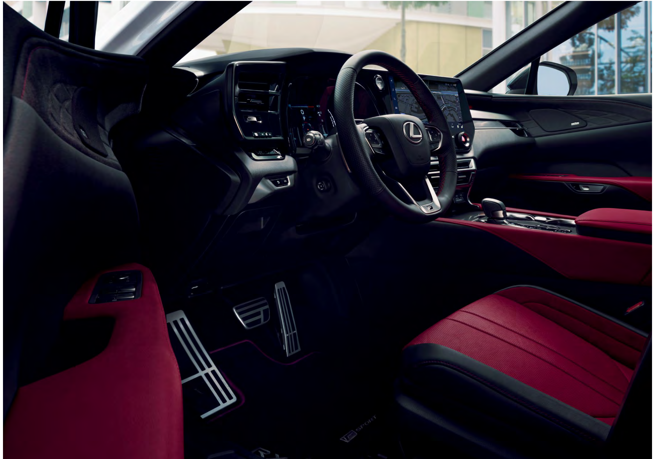
RX F SPORT Performance shown with Rioja Red leather and Dark Graphite Aluminum interior trim

Leave distractions behind. When crafting the interior of the RX, Lexus designers focused on creating a space that was open and inviting, with ready access to the things a driver needs most. Front seats offer an ideal blend of comfort and support, and for the driver, an ergonomically shaped steering wheel and intuitive controls fall easily to hand. Seating position and even the angle of the windshield have been optimized to enhance outward visibility. And an elegantly concealed console storage area and available wireless phone-charging tray 9 help provide easy access to all those important day-to-day items.